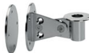
Mirror female fitting stainless steel 316 (ø 25 mm)