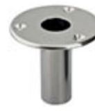
Female fitting stainless steel 316 (ø 25 mm)