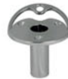
Safety female fitting stainless steel 316 (ø 25 mm)