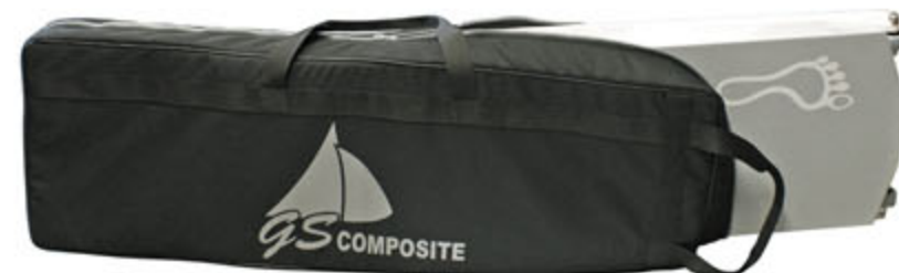
Durable storage bag