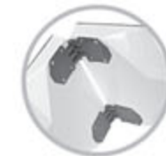
Aluminium acid free hinges