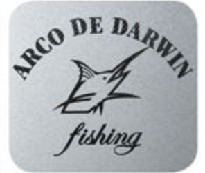
Custom graphic design