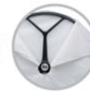
Steering wheel cover