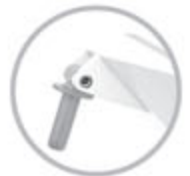
Integrated aluminium male fitting (ø 25 mm)

GS Composite carbon gangways are a leap forward in nautical accessory design and are the first gangways manufactured by the VARTM system. Their extraordinary design, technological innovation and practical value launched GS Composite carbon gangways into the top tier of nautical equipment manufacturers and are now a must-have aftermarket accessory. GS Composite provide a complete range of models and styles, with fixture/fitting options, custom colors, and teak surfacing all available along with a vast number of accessories. These gangways are fully customisable. In 2009 they were awarded the prestigious DAME Award for design and functionality.