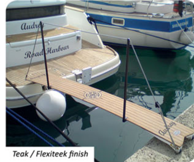
Teak / Flexiteek finish