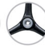
Perfect fit Inox/Al hub