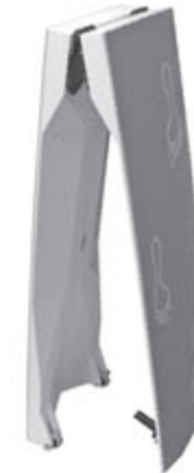
Torsion free construction