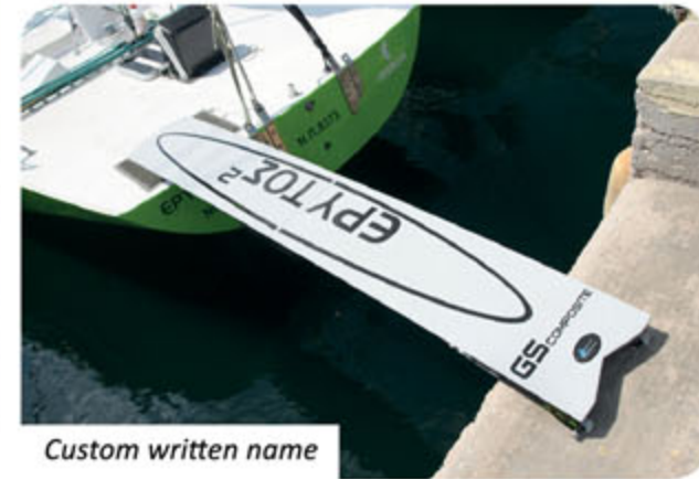
Custom written name