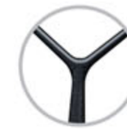
No bonding technology